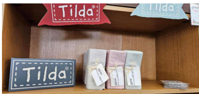
New Arrival - Tilda. More to come!